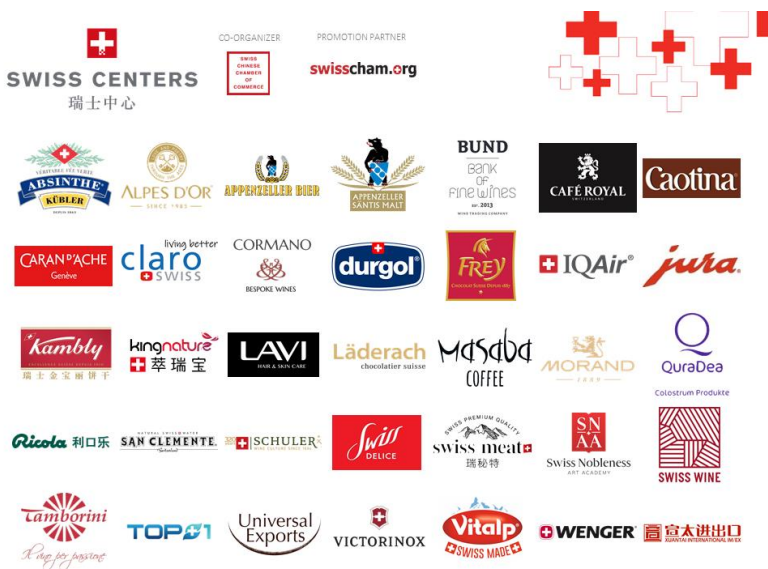
Picture legend: More than 25 Swiss brands showcase their high quality products at the CIIE 2021.