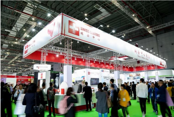
Picture legend: A taste of Switzerland in China: the Swiss Centers organize a Swiss Cluster Booth at the China International Import Exhibition 2021. In the photo is the booth 2019.